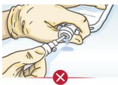
Be careful not to insert spike into stopper at an angle .