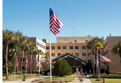
Lake City VAMC