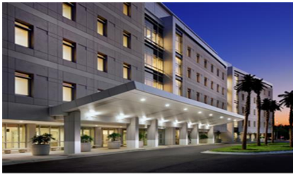
Malcom Randall VAMC

The residency program participates in the National Matching Service and PhORCAS for the application process.