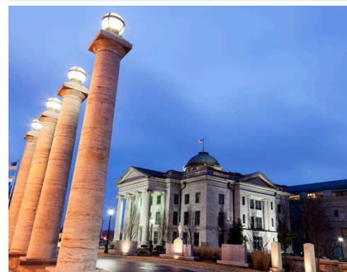
Boone County Court House