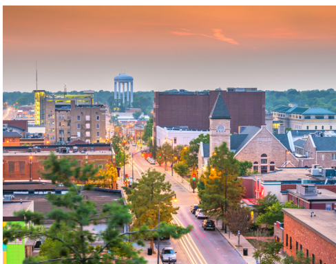
Downtown Columbia, MO

Harry S. Truman Memorial Veterans' Hospital is located in Columbia, Missouri. Often called "College Town, USA," Columbia possesses a unique blend of metropolitan flair and Midwestern hospitality. The city, located approximately 125 miles from both Kansas City and St. Louis, has a population of approximately 126,000, including more than 60,000 students from three colleges. Columbia is a great place to live for many reasons. They have an excellent school system, state-of-the-art healthcare facilities, entertainment opportunities galore, low cost of living, a clean environment and so much more.