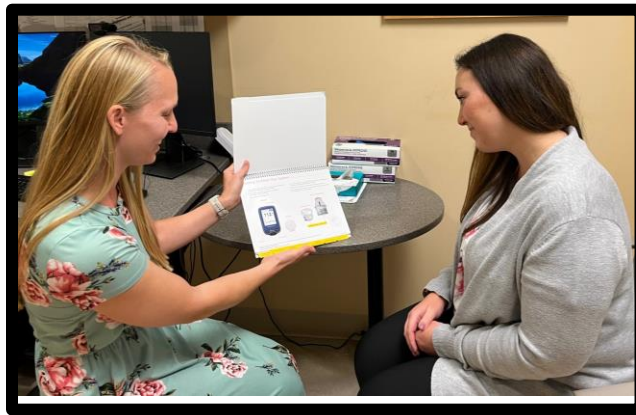
Pharmacist providing education in clinic.

The VACOHCs offers an ASHP-accredited PGY1 pharmacy residency program. Residents receive training in various clinics and perform disease state management including Anticoagulation, Pharmacy Comprehensive Medication Management (CMM), Home Based Primary Care, and Pharmacogenomics. Residents also can spend time with the mental health pharmacist who helps manage outpatient mental health conditions. The residents will also spend time in the counseling and dispensing area of the main outpatient pharmacy. Residents participate in many aspects of pharmacy practice including pharmaceutical care, drug information, staff education, research, quality improvement, and/or systems process redesign projects, pharmacy and therapeutics committee meetings, medication use evaluations, pharmacy practice management, and pharmacy informatics. Residents will gain teaching experience by serving as co-preceptors for PharmD students from various accredited colleges of pharmacy.