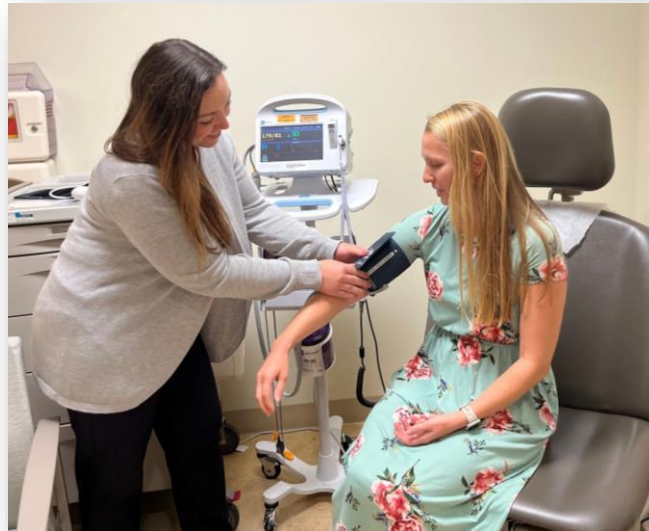
Pharmacist checking blood pressure

Drug Policy –The resident will spend time working with the Associate Chief of Clinical Services longitudinal throughout the residency year(50-52 weeks). This rotation will take no more than ½ day per week and may have time separately assigned or may be combined with assigned project time. Pharmacists at the VA Ambulatory Care Center participate in activities to improve the quality of pharmaceutical care including adverse drug event reporting, medication error prevention, medication error reporting, and medication use evaluations. The Pharmacy and Therapeutics Committee is responsible for local management of the VA national formulary, medication performance measures, and medication use evaluations.