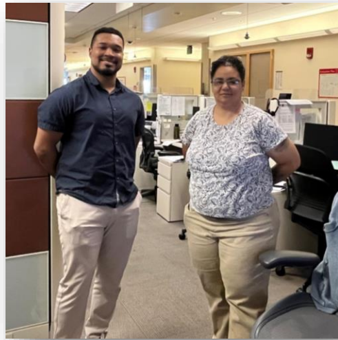
Medical Scheduling Assistants

Endocrinology - Opportunities may exist for the pharmacy resident to work in specialist clinics with the endocrinologist(s) and nephrologist(s) learning about specialized management of issues pertaining to diabetes (insulin pumps, U500 insulin, type 1 diabetes, and use of continuous glucose monitors), hyper/hypothyroidism, hormone imbalance, resistant hypertension, and chronic kidney disease. This elective rotation will occur 1 day per week for 8-10 weeks.