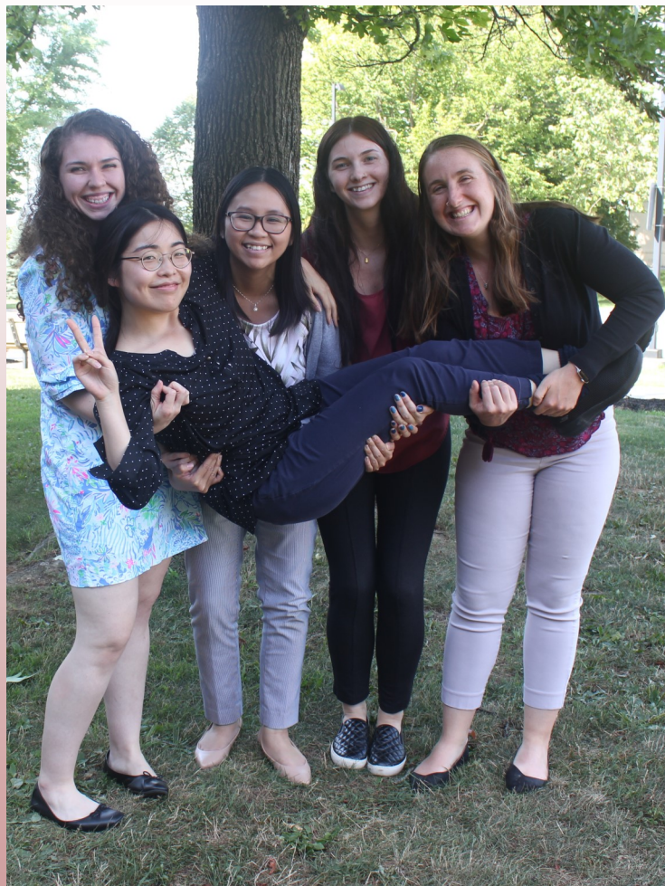
The LVAMC Pharmacy Residency class of 2022—23

If any of the above materials are not received by the application deadline of January 10th , the applicant will not be considered for an interview.