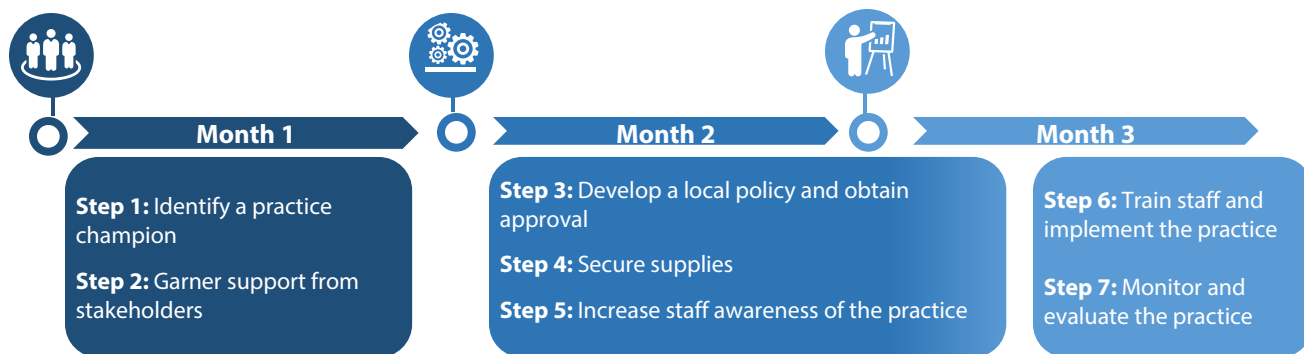
Figure 1. IN Naloxone Carry Practice Implementation Roadmap

We detail each implementation step in the following sections.