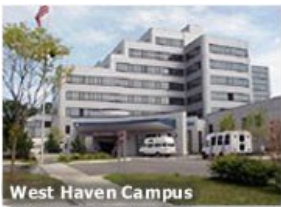
West Haven Campus

The West Haven Campus has a 150-bed hospital, providing acute medical, surgical, and psychiatric care. A full range of ambulatory care services are provided. VA Connecticut conducts research in psychiatry, medicine, surgery, neurology, and related basic sciences. Special research programs in West Haven include national centers for research in schizophrenia, substance abuse, and post-traumatic stress disorder.