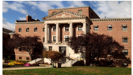
Montrose Campus 2094 Albany Post Road Montrose, NY 10548