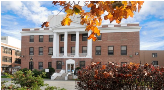
Castle Point Campus 41 Castle Point Road Wappingers Falls, NY 12590