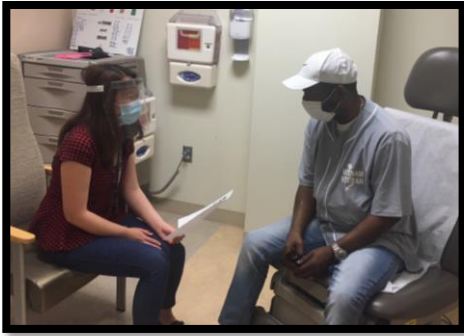
Pharmacy resident interviewing a Veteran